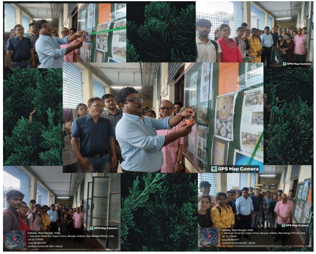
INAUGURATION OF WALL MAGAZINE-"BLOOMING BUDS"-2.2